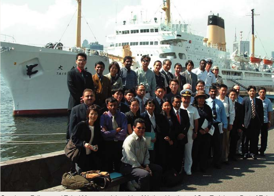
Sasakawa Fellows and Taisei Maru, a training ship of National Institute of Sea Training at Port of Tokyo

Before this courtesy call, the Group C: Shipping Management students visited the Museum of Group D: Port Management Maritime Science to see a spy ship Group E: Maritime Security from North Korea.