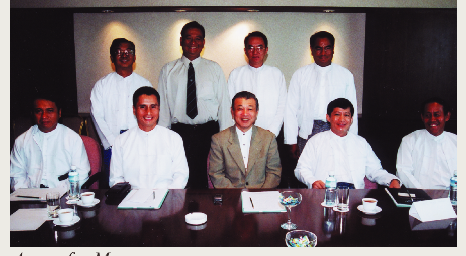
A man for Myanmar

how and expertise to harness and moving force behind the development Shipmanagement Co., Ltd. attended exploit its own diverse inland and marine resources, so that the that is rightly known as the best in the generations to come will benefit from region, in terms of quality, work ethic its present endeavors. One obvious and know-how. strategy is higher education and more training to maintain the momentum of and the unspoken sentiments of those the acquisition of know-how.