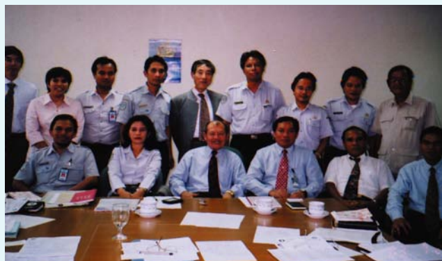
Smiles of WMU graduates, Jakarta