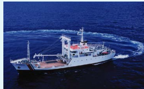
"Jadayat" during her sea trial

Under the administration of Directorate of Navigation, Directorate General of Sea Communication of Communications Ministry, the 13.2m buoy tender, "Jadayat" (meaning Tropic of Capricorn), will be based at Kijang Port on Bintan Island to undertake maintenance and repair of navigation aids attached to waters of the Straits of Malacca and Singapore. Together with a similar ship which MSC donated to Malaysia last year, it is highly expected that the deployment of "Jadayat" will remarkably increase the maintenance capacity of navigation aids in the world's busiest and narrowest waters.