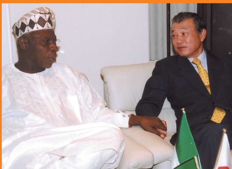
Meeting with the president of Nigeria, H.E. Olusegun Obasanjo

M any countries in Africa have had to deal with debilitating problems, ranging from a heavy debt burden to poverty, hunger, epidemics and civil wars. Of the 54 countries in Africa, nine are leprosy endemic, with three (Madagascar, Mozambique and Angola) having a prevalence rate of more than three per 10,000 inhabitants. In my position as special ambassador for the elimination of leprosy, I visited these three countries during the past year to meet with the top leaders and discuss the leprosy situation there. I was also able to meet the leaders of six African countries while they were in Japan for the Third Tokyo International Conference on African Development (TICAD III), held in late September.