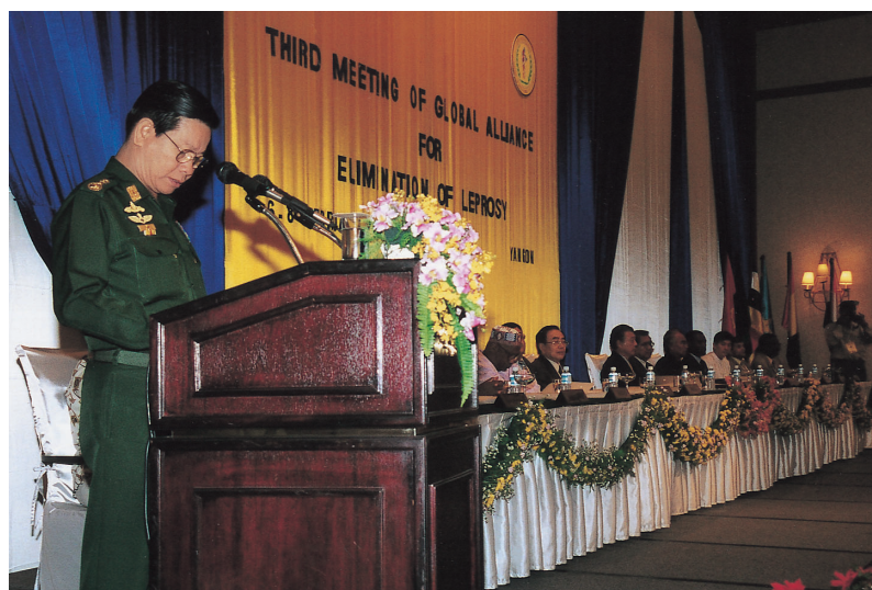
H.E. General Khin Nyunt announces leprosy elimination.

A complete copy of this paper can be found at The Nippon Foundation's home page, www.nippon-foundation.or.jp/eng/ □