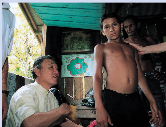
With the family of a patient in Amazon

I also had an opportunity to visit the Amazon State capital of Manaus and the nearby city of Manacapuru, both of which have a high incidence of leprosy. The Health Bureau of Manaus kindly arranged for us to visit clinics and nearby villages where leprosy patients live. We traveled with local paramedics to small villages on the banks of the Amazon River, where we visited the homes of people undergoing treatment. I was very impressed with these paramedics' dedication to detection, medical care, record keeping and skilled operational management. I was deeply touched by the warm care given by family members. Contrary to what has often been the case in the past, in that region the patients are not abandoned but protected and cared for by loved ones. This degree of warmth would not have been possible without a successful campaign of information dissemination.