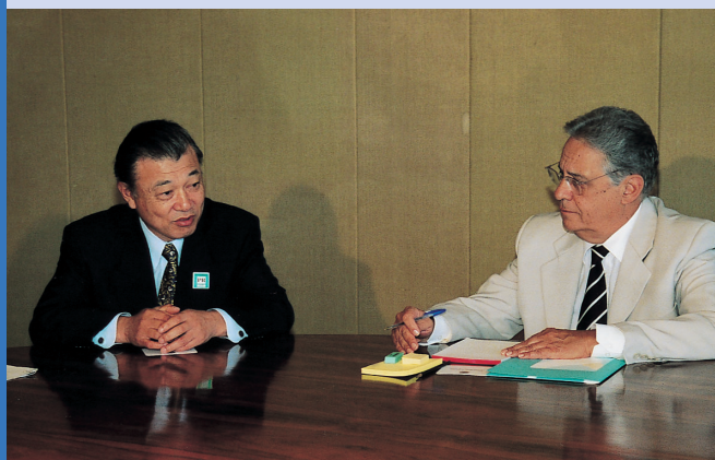
Yohei Sasakawa (left) with President Cardoso of Brazil

My first leprosy-related activity of the year 2002 took place in Brazil when I participated in the Second GAEL Meeting, held in Brasilia from January 29 to 31. Taking advantage of this opportunity, I met with then President Fernando Henrique Cardoso on January 30 and asked his excellency to give leprosy elimination a high priority among the country's many public-health issues. President Cardoso expressed his willingness and a strong commitment to promote leprosy elimination as an important part of his government's agenda. He evaluated the concept of GAEL highly, placing