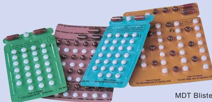
MDT Blister Packs